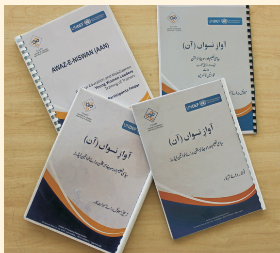
Training manuals produced for AAN by CGaPS.

The national and provincial secretariats and the AAN local chapters will mobilize resources in support of their activities.